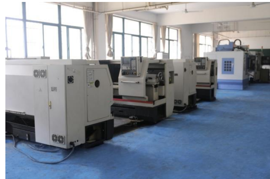
Advanced Manufacturing Technology Training Base