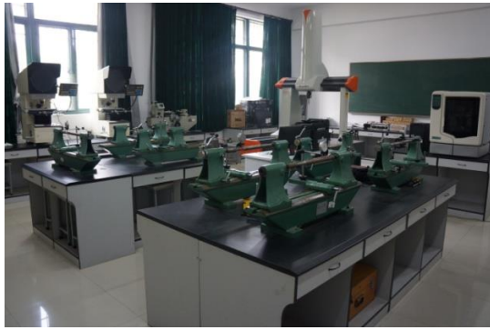
Interchangeability and Measurement Technology Lab