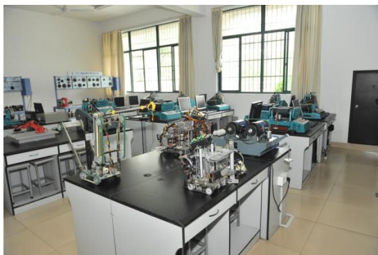
Mechanical Design and Innovation Laboratory