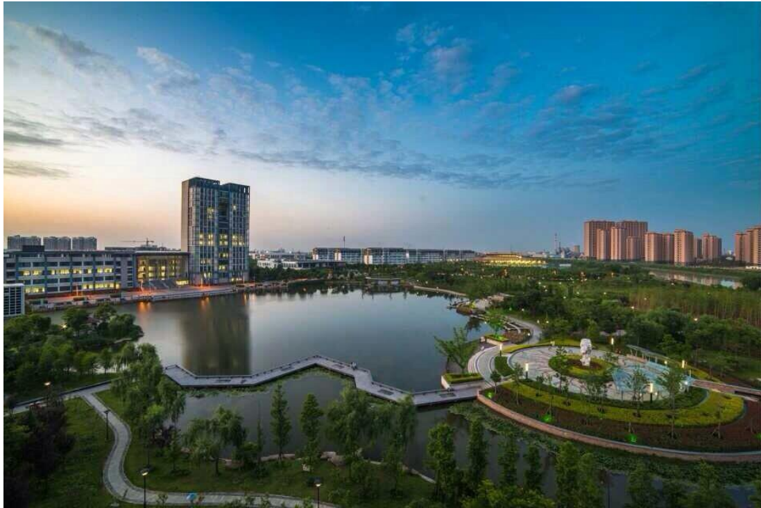
The campus landscape