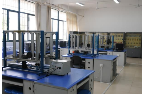
Mechanical Principles Laboratories