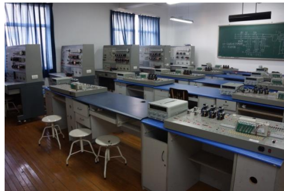
Control Theory and Technology Laboratory