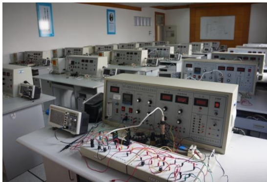
Sensors and Detection Technology Laboratory

The Mechanical Electronic Engineering Experimental Teaching Center includes 1 Provincial Electronic Information and Experimental Teaching Demonstration Center, 1 Mechanical Engineering Experimental Teaching Center, with a total of 25 experimental compartments. The college also occupies a huge area of experimental space amounting to 4,000 square meters and owns laboratory equipment worth 12 million yuan. Besides undertaking experimental and practical courses of three majors in the college, the center also takes responsibility for practice teaching and students' research activities of engineering specialty all over the university.