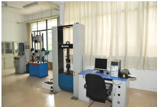
Engineering Mechanics Lab